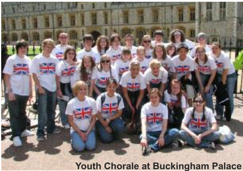
Youth Chorale at Buckingham Palace

The one thing that never changes is the need for community generosity. Tuition covers about half of IYC's operating costs. We are fortunate to receive grants from the Iowa Arts Council, Bravo and other organizations, but we count on individual donations. Our growth has been fueled by your generosity. If you like what you're reading in this newsletter please consider making your tax deductible donation today. You can even choose to receive our latest CD for your kindness.