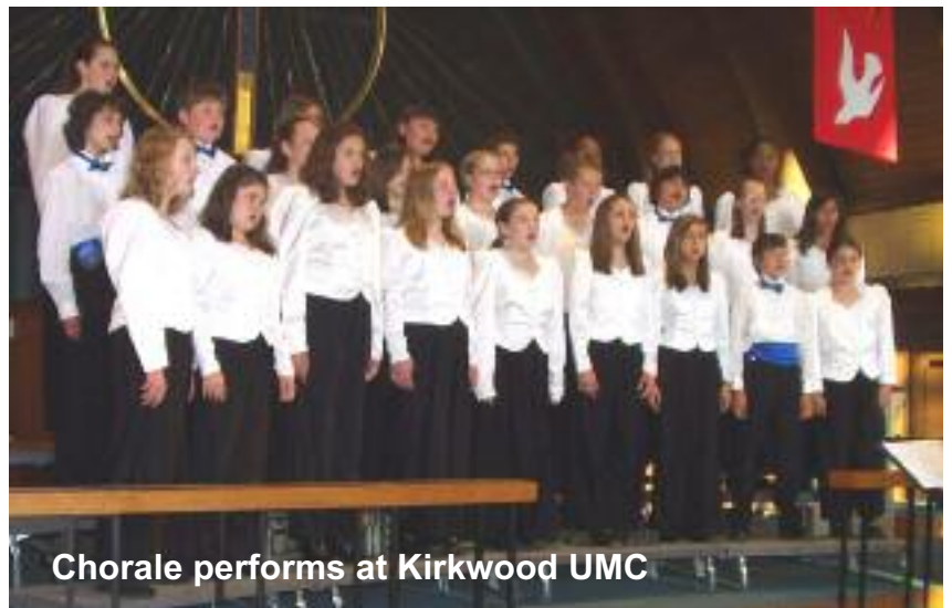
Chorale performs at Kirkwood UMC