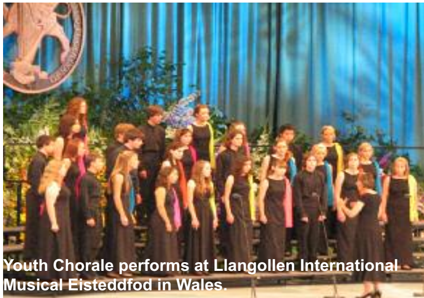
Youth Chorale performs at Llangollen International Musical Eisteddfod in Wales.

it was on to Scotland with a performance at Stirling Castle and St. Giles Cathedral ... Continued on page 2